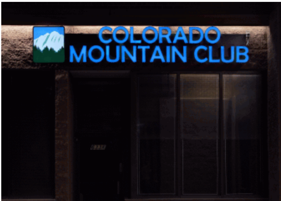
The New Clubroom Sign

An organizational meeting will be held on Tuesday, December 6 for those interested in the Greater Canyonlands campaign. The Southern Utah Wilderness Alliance are working on building support for Utah wilderness among Coloradans. The meeting will be held at the Meadows Library at 4800 Baseline Road, Boulder from 6:30-8:30 pm. Pizza will be served.