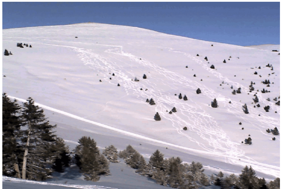
Ptarmigan Peak/Machine Gun Ridge