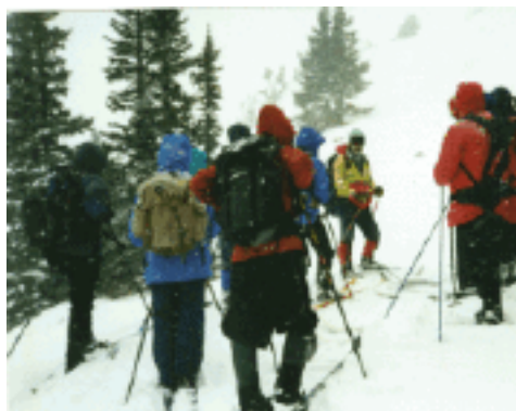
Keeping the group together

We skied west, crossed Boulder Pass, and ascended the steep terrain to the Rollins Pass road. The wind was picking up, snowfall was increasing, and visibility was decreasing. We set off on the Rollins Pass train grade. Soon we encountered the steep snow chute that had to be crossed to the first trestle. With some dismay, I set the track across it. It seemed okay. The drop to the valley floor is about 1,000 feet. We crossed it although I have never been able to do it again.