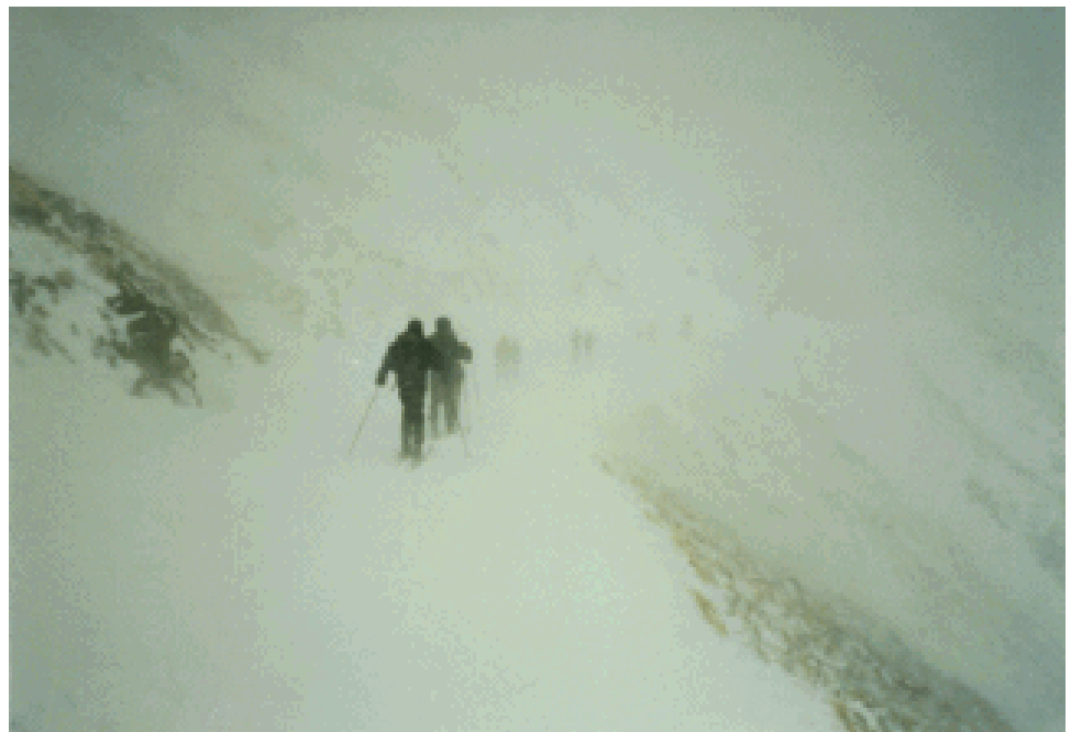
Rollins Pass Whiteout