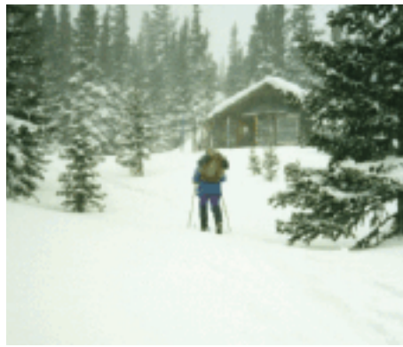
Guinn Mountain Hut

Rollins Pass the weather is going to get worse. This is what we are going to do."