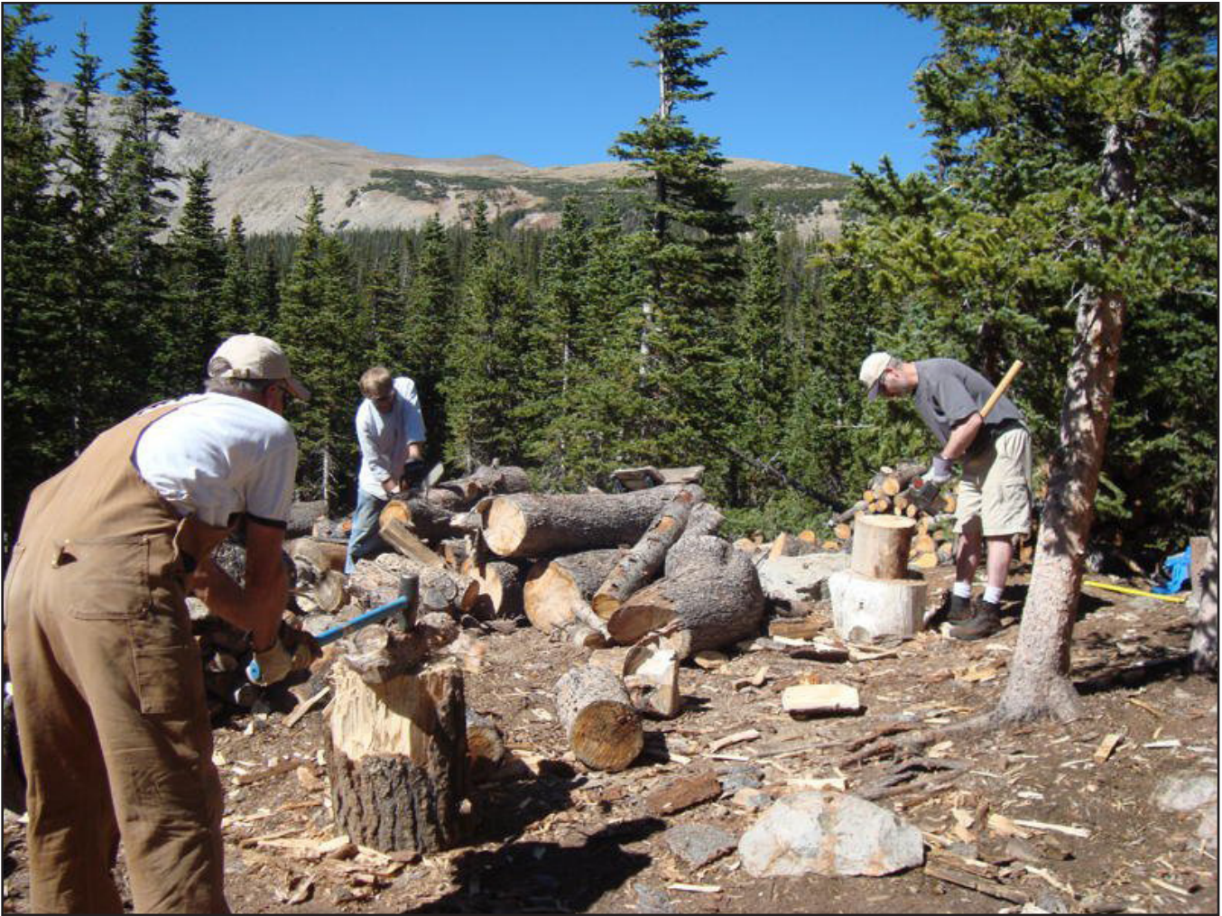
Wood choppers hard at work during the fall 2010 Brainard Cabin work party, Saturday, September 25 th

http://www.cmcbooulder.org/docs/CabinsCommittee/public/Brainard_Cabin_Handbook.pdf