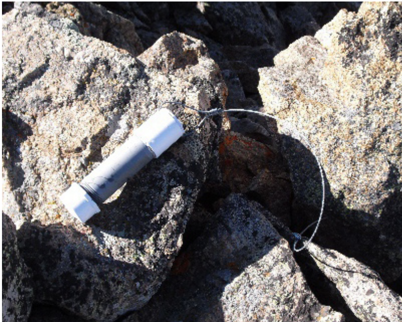
Summit register made of PVC tube

After a little searching on the web, and buying a few samples, I've found some one quart glass jars with tight-fitting plastic lids. With a little modification, a CMC register fits comfortably inside one of these jars. A CMC register is 6.5" wide, and that gives a very tight fit. I trim 3/4" from the right side of the register, allowing it to fit easily while still preserving room