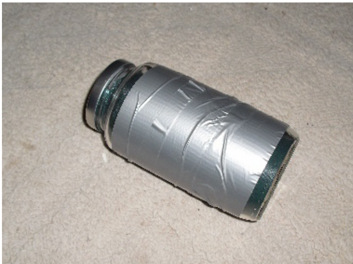
Glass register wrapped in duct tape