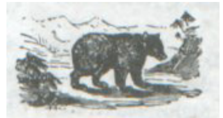
Beware the foraging bears!