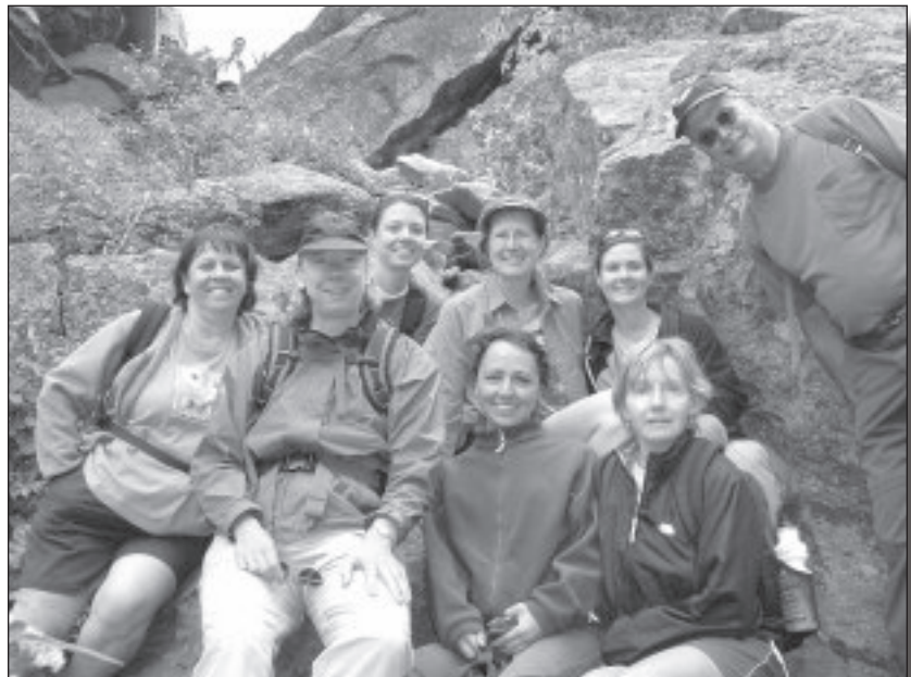
A New Members hike to Royal Arch in May 2005 (we're not sure about the guy in the back though!)