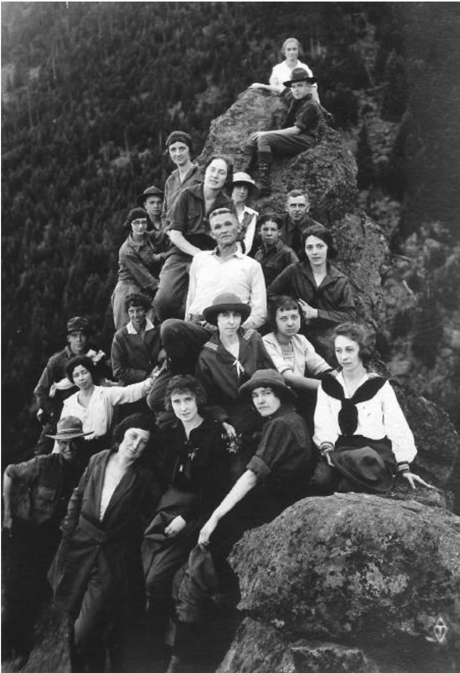
CMC Hikers in the Flatirons, 1912.