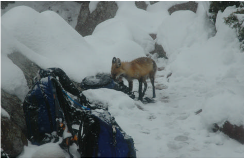
A lovely little red fox sniffs hopefully at students' backpacks near Crown Rock.